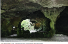
The Huel Lee Cave, created by the extraction of millstones

On my final day, I made the short walk from Berdorf to the circular El Wollefsschlucht trail, or “Wolf's Gorge”, a dramatic ravine once rumoured to shelter wolves. Starting in Echternach the trail led to Huel Lee, a man-made cave where millstones were quarried for local castles and monasteries in the Middle Ages. The path gradually climbed through quiet forests that afforded glimpses of the Sûre River before Echternach's rooftops appeared in the distance. When I emerged back onto the town's streets, I realised I hadn't seen another soul for hours.