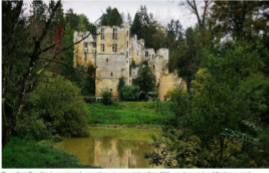
Beaufort Castle, in eastern Luxembourg, consists of an 11th century ruined fortress and a nearby Renaissance chateau