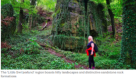
The ‘Little Switzerland’ region boasts hilly landscapes and distinctive sandstone rock formations

My first day's walk followed Mullerthal Trail Route 1 from Echternach, a town 10 minutes from Berdorf by bus, to Rosport. Recently nourished by rain, the trail wound through lush forests, all calm and tranquility, the sounds of streams and birdsong accompanying me, echoing off the majestic moss-covered sandstone cliffs.